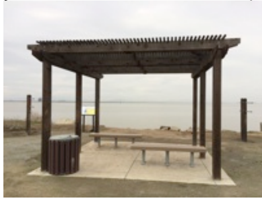
View of the lookout looking west.