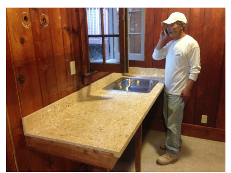
New countertop in Cabin 4 kitchen.

Yurts remain very popular. They are full on weekends but reservations are slowing down now as the summer season ends. Occasionally we receive comments about highway noise but generally our "glampers" are very happy to be in a yurt.