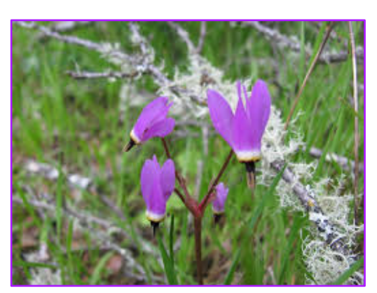
Henderson's Shooting Star