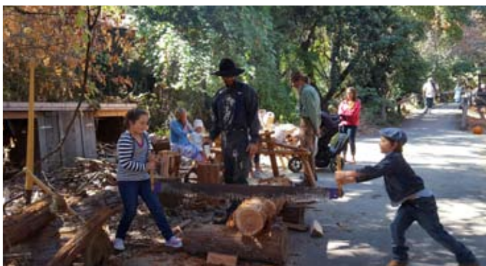
Working together with the cross-cut saw