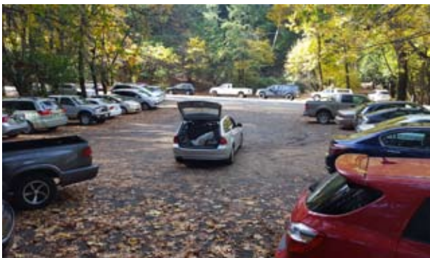
The parking area is packed every weekend

The parking lot continues to be a drop zone for household and construction site garbage. Each dump is cleaned up as soon as it is noticed and parking lot cleared of litter each week. Vehicle break ins are still being reported as this is a popular spot for thieves to take advantage of the park visitors that leave valuables in their cars.