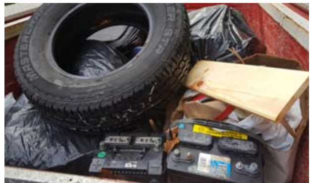
Dumped items all dropped in one spot taken to the park dumpster.