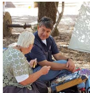
Lace maker explaining her craft