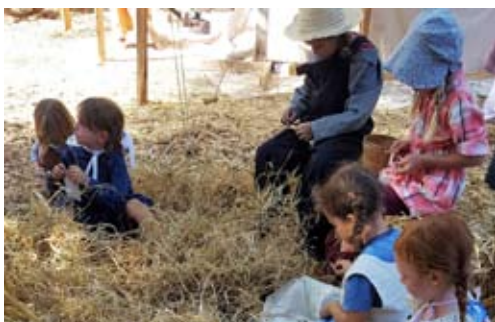
Shelling dried beans is a hit

This year's two day event was graced with perfect temps and a slight drizzle of rain on Sunday morning, that did not stop visitors coming to the event. If you have not experienced Old Mill Days, it is certainly a must do for next year. Each year, we try and add something new. In the past, chili was made for the event along with corn bread and apple juice. It was decided to try beef stew. It was a huge hit with the visitors that could purchase a lunch for a nominal fee. Everyone enjoy the taste of the hearty meal that was a staple for pioneer families. Corn bread, along with apple juice topped off the tasty stew. This event is always a success because of the staff and volunteers that enjoy sharing the history of the pioneer era and making the park experience an event to remember for a lifetime.