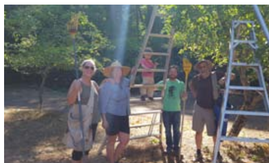
Park Staff picking apples for Old Mill Days