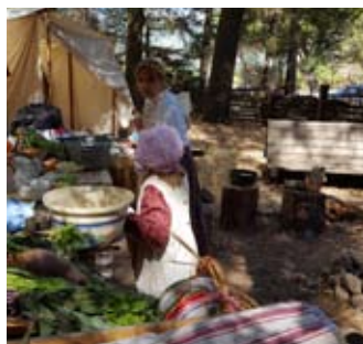
Helper in the kitchen