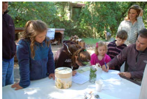
New members sign up

A wooden pulley was returned! An elderly visitor to the mill came by and handed mill staff one of the original wooden pulleys to the mill he had kept over 50 years. As a young boy he had played at the closed mill and had kept an old wood pulley as a souvenir. Its return is wonderful. This artifact will be an interpretive tool that can illustrate for visitors how wooded pulleys were made “back in the day”.