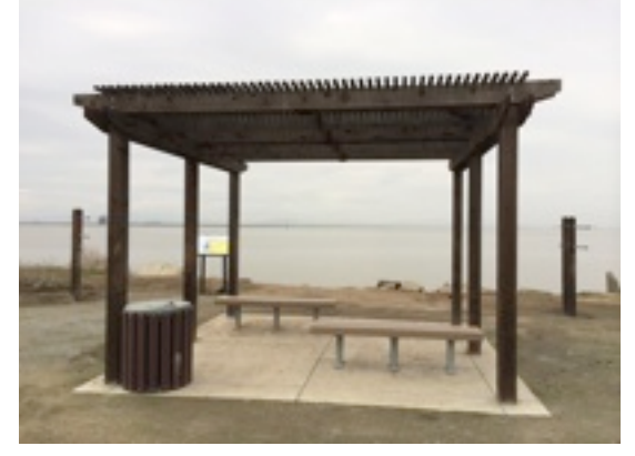
View of the lookout looking west.